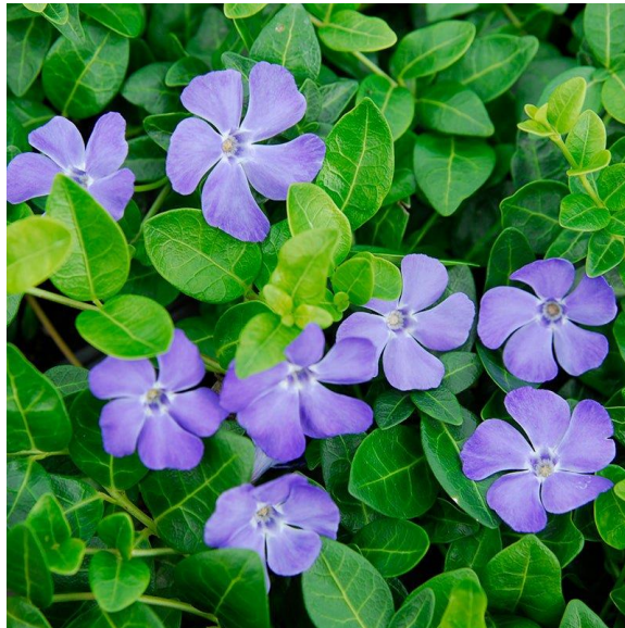
'Bowles' Periwinkle Vine

Never again will you have to sacrifice colorful blooms in order to ward off deer! Also known as vinca or myrtle, ‘Bowles’ Periwinkle Vine is known for its lavender flowers that bloom in spring, glossy foliage, and clump-forming habit- so it is more sedate in spreading. And the best part? Deer generally tend to avoid them! This shade-loving deer-resistant perennial is also drought-tolerant once established, making it a durable ground cover choice for beginner gardeners.