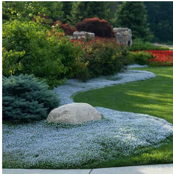
Blue Star Creeper ( Isotoma fluviatilis )

Cover your landscape with Blue Star Creeper : a starry carpet of soft blue blooms during the spring that then turns to long-blooming flowers in the summer. This ground cover is popular at Great Garden Plants for a reason: Blue star creeper tolerates foot traffic, making it an excellent lawn alternative for those looking to add more color and texture to their landscape. While deer may walk through this lovely spring-blooming ground cover, they generally avoid taking a nibble.