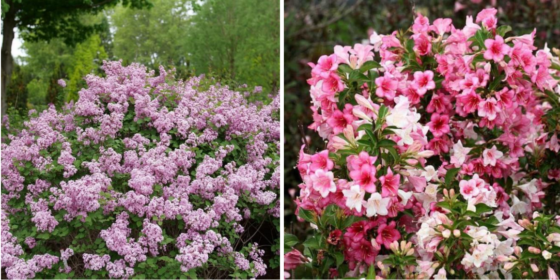
Czechmark Trilogy® Weigela

Lilacs that bloom in the spring represent renewal and confidence. Welcome in the good gardening vibes with hundreds of flowers that bloom from spring to fall. The Bloomerang® series of lilacs from Proven Winners ColorChoice Shrubs were selected for their compact habit and incredibly long bloom time. While this flower is sweetly scented and enchanting to humans, deer tend to avoid these. As an added bonus, these deer-resistant plants are low maintenance as well.