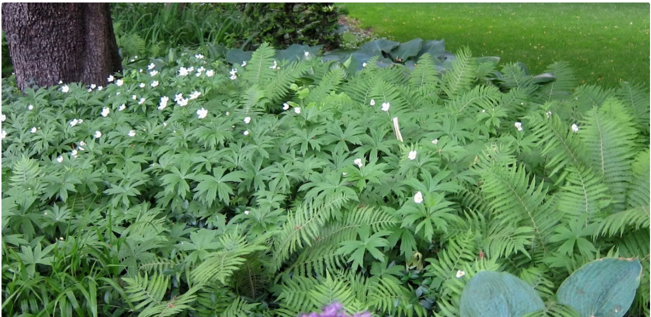
Canada anemone is a strong spreader that pairs best with equally vigorous companions, such as the ostrich fern seen here.

Size and habit: This is an herbaceous groundcover that stands 12 inches tall and spreads by rhizomes to fill available space. Be aware that where happy it can make a sizable colony. Plant it where you don't mind its spread and/or plant it with equally strong-growing companions, because it will likely outcompete more delicate or slow-growing perennials. Try it as a carpet around trees and shrubs.